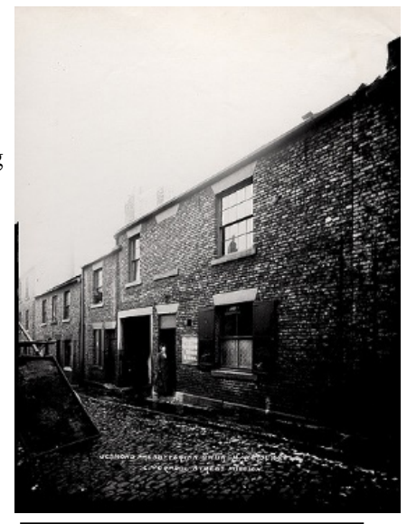
Liverpool St. Mission c.1912 Newcastle Libraries 230242

congregation as well as on those who received the help. As the war progressed there is less mention of making clothes, presumably as the forces' own supplies improved, but the provision of parcels for the 75 serving men from Liverpool Street Mission continued (MM May 1916). This was in a poor area of Newcastle just south of St Thomas' Crescent and opening at one end onto Percy St. next to the Percy Arms. The recipients were clearly delighted that they were being remembered by the people in the 'old country' and the Young Ladies of the church continued collecting so as to send comforts to the soldiers. The Young Ladies' Work Party had their Annual Sale for Liverpool Street Mission on April 4th 1916 (MM April 1916) at which they had a Soldiers' Comforts stall. 'The soldier seems to be able to get through a marvellous number of socks in a comparatively short time, and these socks are made and to be sold that they may be sent to the 5th Northumberlands, whose officers have been asking us for such gifts.'